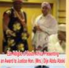
Hon. Justice Oluwole Presenting an Award to Hon. Justice Oluwole