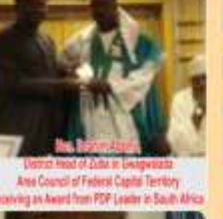
Hon. Justice Oluwole Presenting an Award to Hon. Justice Oluwole