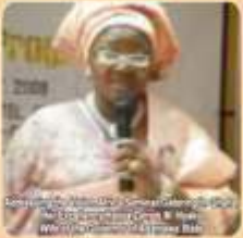
Hon. Justice Oluwole Presenting an Award to Hon. Justice Oluwole