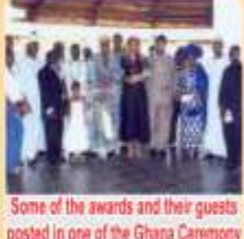
Some of the awards and their guests posted in one of the Ghana Ceremony