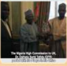
Hon. Justice Oluwole Presenting an Award to Hon. Justice Oluwole