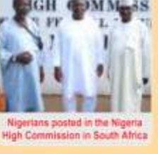
Nigerians posted in the Nigeria High Commission in South Africa