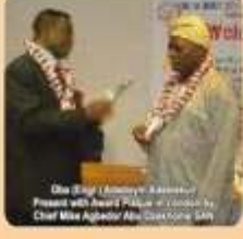
Hon. Justice Oluwole Presenting an Award Plaque to Hon. Justice Oluwole