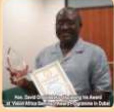
Hon. Justice Oluwole Presenting an Award to Hon. Justice Oluwole