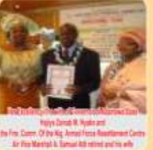
Hon. Justice Oluwole Presenting an Award to Hon. Justice Oluwole