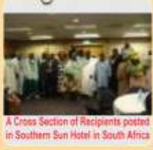
A Cross Section of Recipients posted in Southern Sun Hotel in South Africa

The view of Vision Africa Seminar / Award Programme in SA, Ghana & Dubai