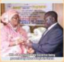
Hon. Justice Oluwole Presenting an Award to Hon. Justice Oluwole