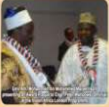
Hon. Justice Oluwole Presenting an Award to Hon. Justice Oluwole