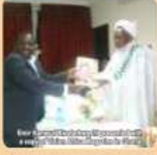
Hon. Justice Oluwole Presenting an Award to Hon. Justice Oluwole