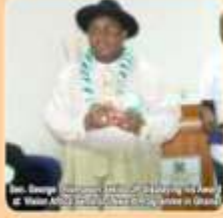
Hon. Justice Oluwole Presenting an Award to Hon. Justice Oluwole