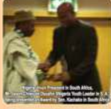
Hon. Justice Oluwole Presenting an Award to Hon. Justice Oluwole