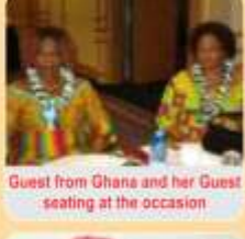
Guest from Ghana and her Guest seating at the occasion