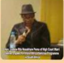
Hon. Justice Oluwole Presenting an Award Plaque to Hon. Justice Oluwole