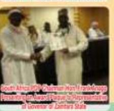
South Africa Hon. Ndlovu Presenting an Award Plaque to South Africa Hon. Ndlovu