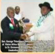
Hon. Justice Oluwole Presenting an Award to Hon. Justice Oluwole