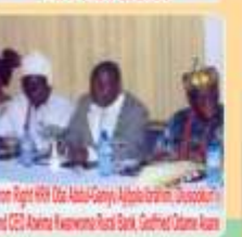
Hon. Justice Oluwole Presenting an Award to Hon. Justice Oluwole